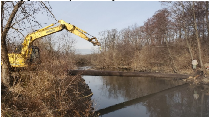
Feed pipe removal from DuPage River at Hidden Lakes